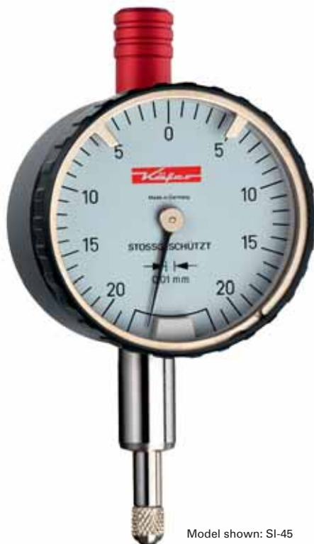
Model shown: SI-45